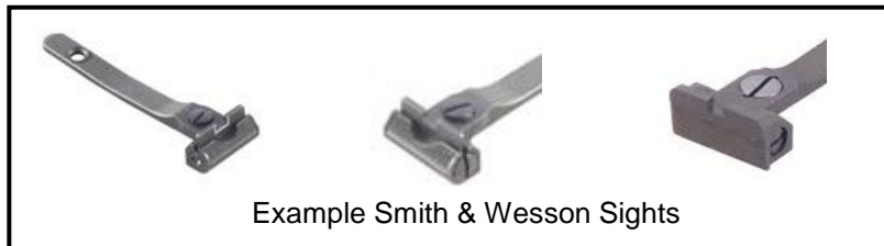
Example Smith & Wesson Sights