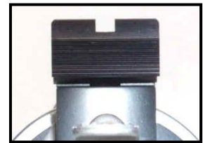
Weigand Combat Handgun Enhanced Rear Sight Blade